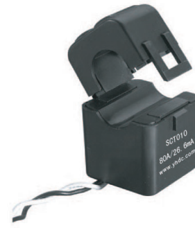
Characteristic curve in different load volt-ampere: